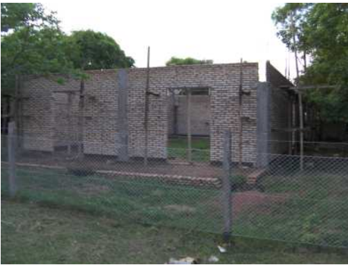
Construction of the multi-use facility in Quyquyho.

It was all so good and we thank the Collingwood Church for this special offering allowing us to take everybody on these outings.