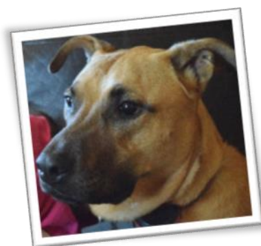
Sampson is a 5 year-old German Shepard mix who is surprised to find himself living in Paraguay. However, he's now enjoying getting to know new doggie pals and country life.