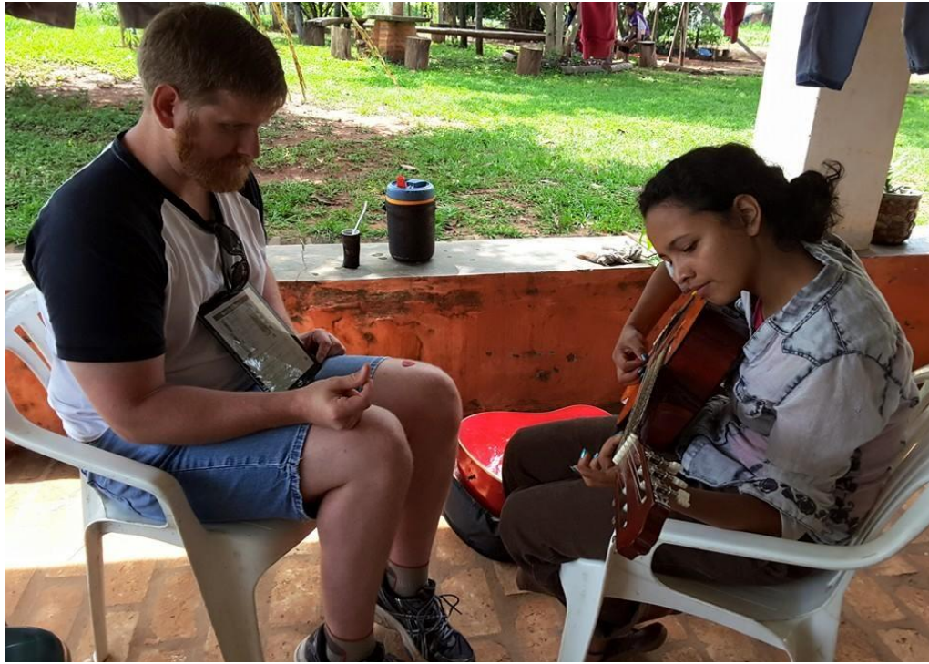
SPREADING GOD'S LOVE IN PARAGUAY WITH THE POWER OF MUSIC