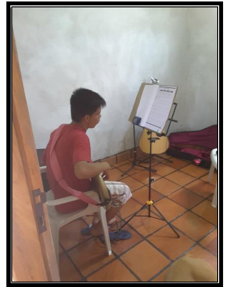
One of Mission 403's students practices his electric bass lesson.

All instruments or donations given to Mission 403 always go directly to support the ministry. Already, we are seeing people being drawn into the church through music and the opportunity to learn how to play a musical instrument. The people here are amazed that they can learn how to play an instrument for absolutely free. Mission 403 always wants to be able to provide this ministry free of charge to the people of Paraguay, but we cannot do this without your support. Please consider helping us buy some of these instruments, and if you would like to offer regular support to Mission 403 please turn to page 4 of this newsletter to learn how you can become a monthly donor.