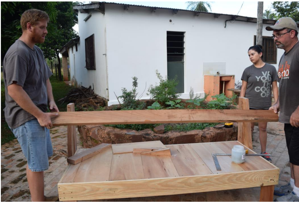
SPREADING GOD'S LOVE IN PARAGUAY WITH THE POWER OF MUSIC