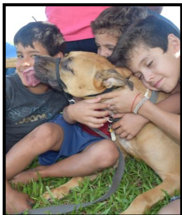
Sampson is a 5 year-old German Shepard mix living in Paraguay. He loves giving kisses to little kids who lay on him.